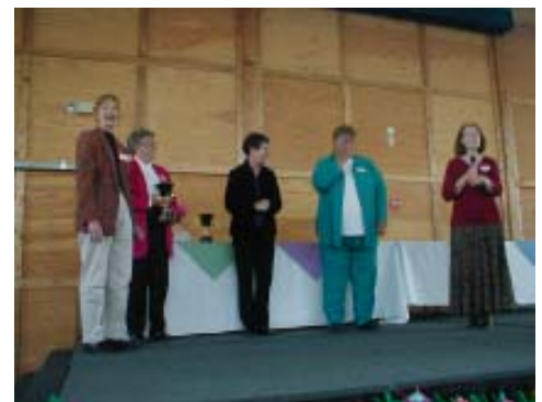
The Redmond Office was an award winner last year

Recognizes a Field Office, Satellite Office, One-Stop or Section for exceptional service to the Association and/or outstanding commitment to employment, unemployment, training, child care or related programs in the workforce development arena. Nomination Categories-Small (20 or less employees) and Large (21 or more employees). [Must be nominated by an IAWP member, although a team of members and non-members may submit a nomination.] Judged-Oregon Chapter Award [International offers a One-Stop of the Year award.]