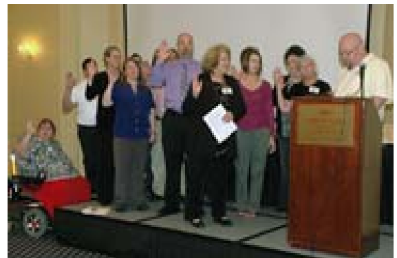
Swearing in of new Officers