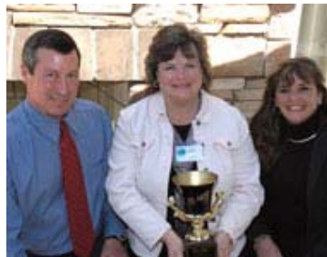
Region 13 {LaGrande, Enterprise, and Baker}